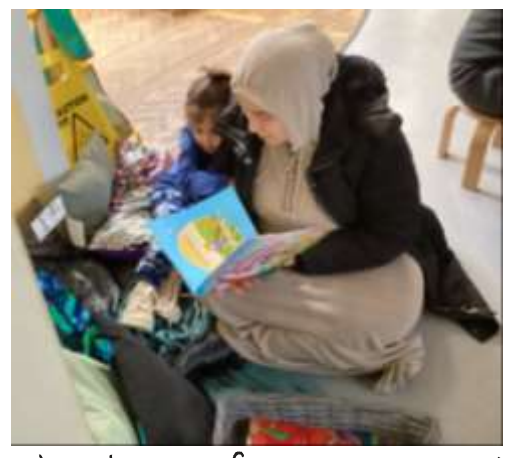
Thank you for your support